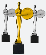
Golden Drums Slovenian Advertising Chamber