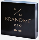
BrandMe CEO Forbes Poland