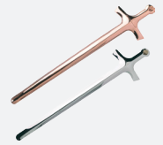
KTR Golden/Silver Swords Advertising Creators Club