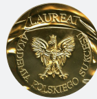
Golden Medal Polish Academy of Success