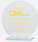
Merchant Team of the Year CNP Awards 2021