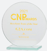
Merchant Team of the Year CNP Awards 2021