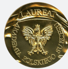
Golden Medal Polish Academy of Success