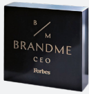
BrandMe CEO Forbes Poland