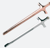
KTR Golden/Silver Swords Advertising Creators Club Poland