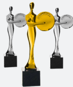
Golden Drums Slovenian Advertising Chamber